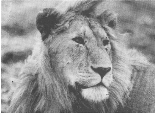
Many lions have distinctive ear notches.